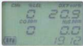
▲ Normal measurement