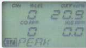
▲ Peak screen